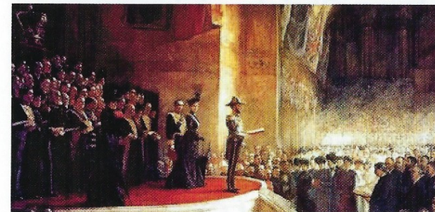
Our First Parliament opened in Prayer 9th May 1901