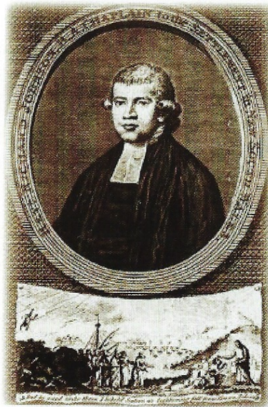
Johnson, Richard (1753 - 1827)

Australia's first minister, Reverend Richard Johnson arrived on the first fleet. The first Christian service in Australia was held on 3rd February 1788.